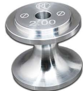
Roller Pressure Die $49

The most economical option. Requires lubrication and cannot be used with aluminum.