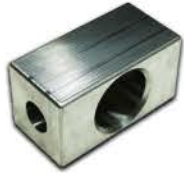
Northern Tool HD Sleeve #1488