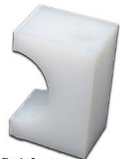
UHMW Pressure Die $38

Does not require lubrication and greatly reduces the risk of drag marks down the side of your material.