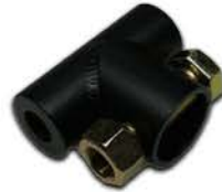
Harbor Freight HD Sleeve #100218