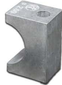
Standard Pressure Die $19

The most economical option. Requires lubrication and cannot be used with aluminum.